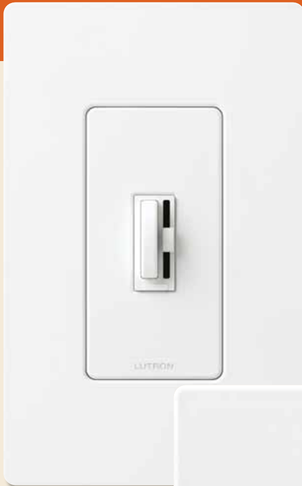
Wall Dimmer New designer inserts included in package

Create a safe path of light to, through, and around the home